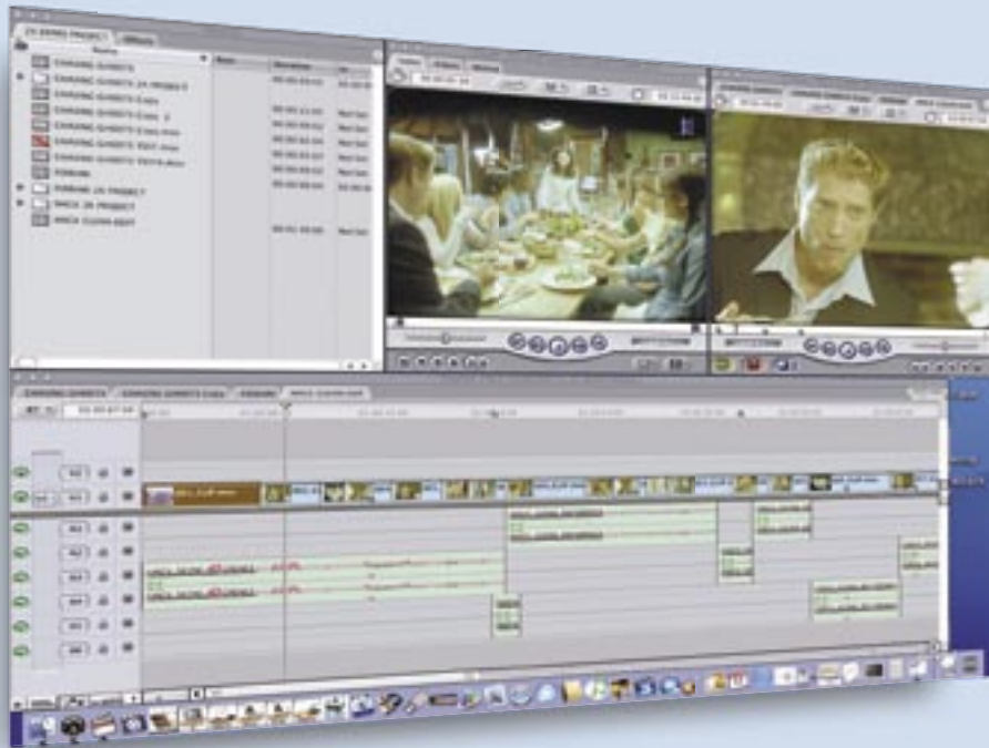
APPLE FINAL CUT PRO™ AND KONA

All of this, combined with AJA's 3-year warranty and world-class support, make KONA the logical choice for any and all professional work on the Mac.